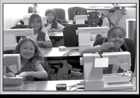
TANNER SEWING AND VACUUM CENTER Old-Fashioned Service & Top Quality Products